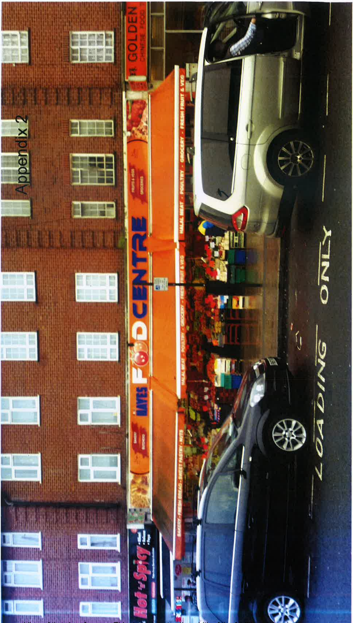
View of the shop face on. This demonstrates the width of the facility.