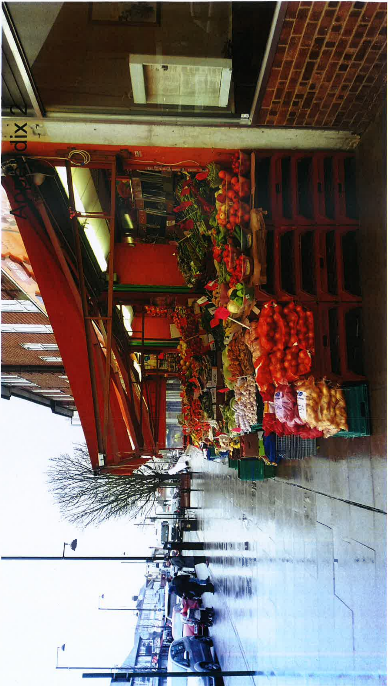
This shows a more up close photo of the display facing away from Station Road Hayes.