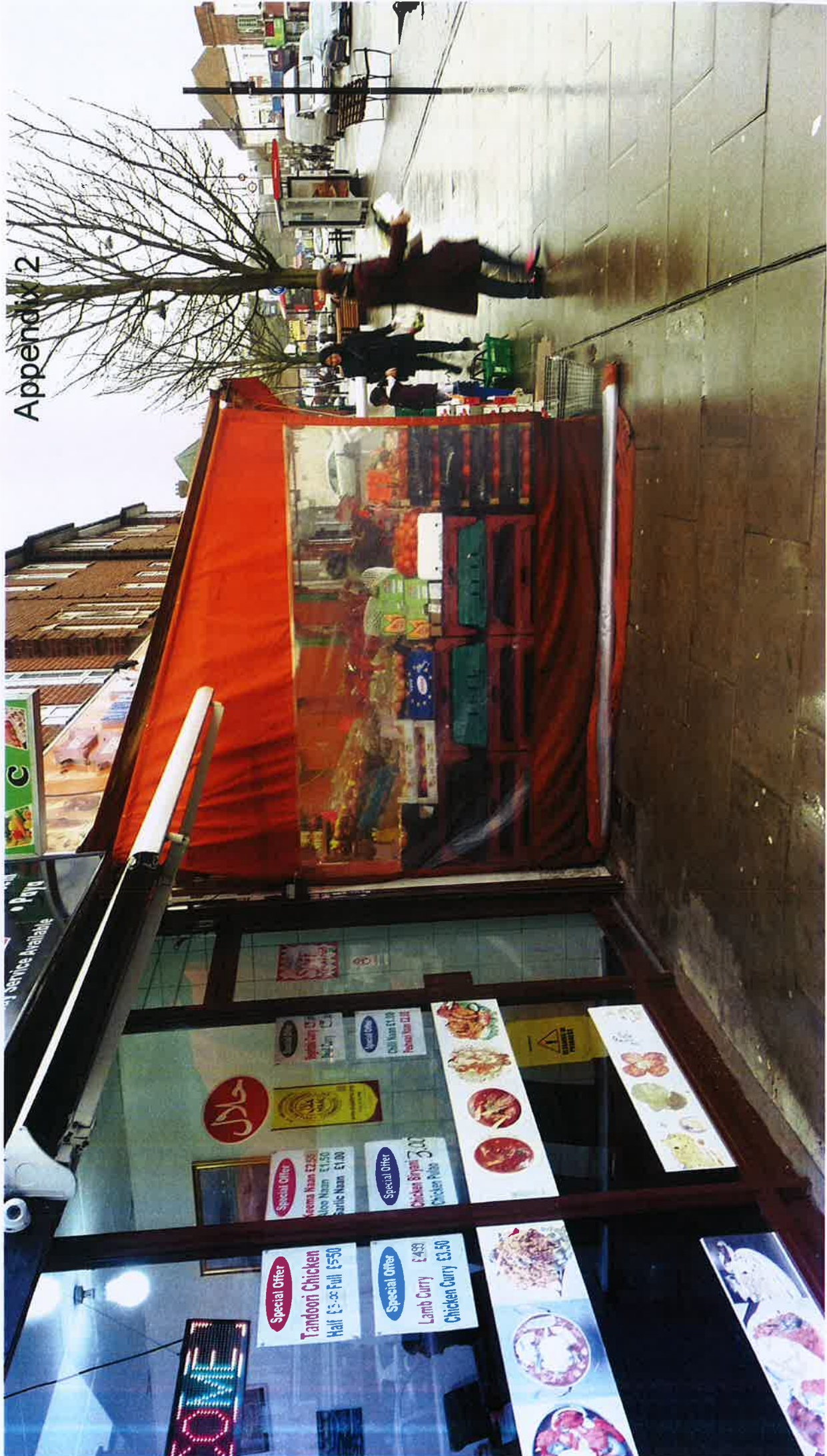
View of the shop front facing towards Station Road Hayes.