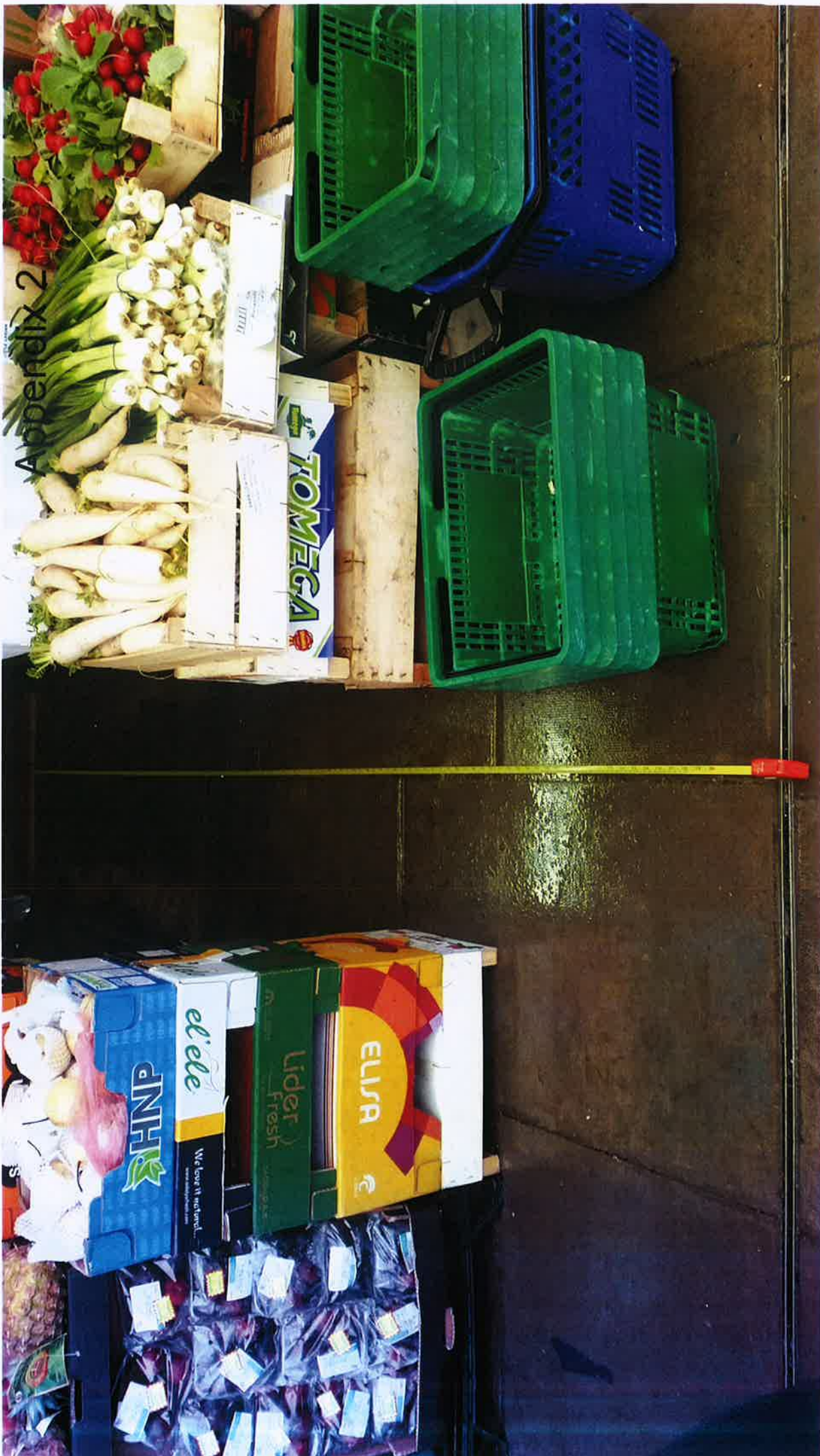
This picture shows the length of the display. The tape measure is 3 metres and the approved length is 2 metres.