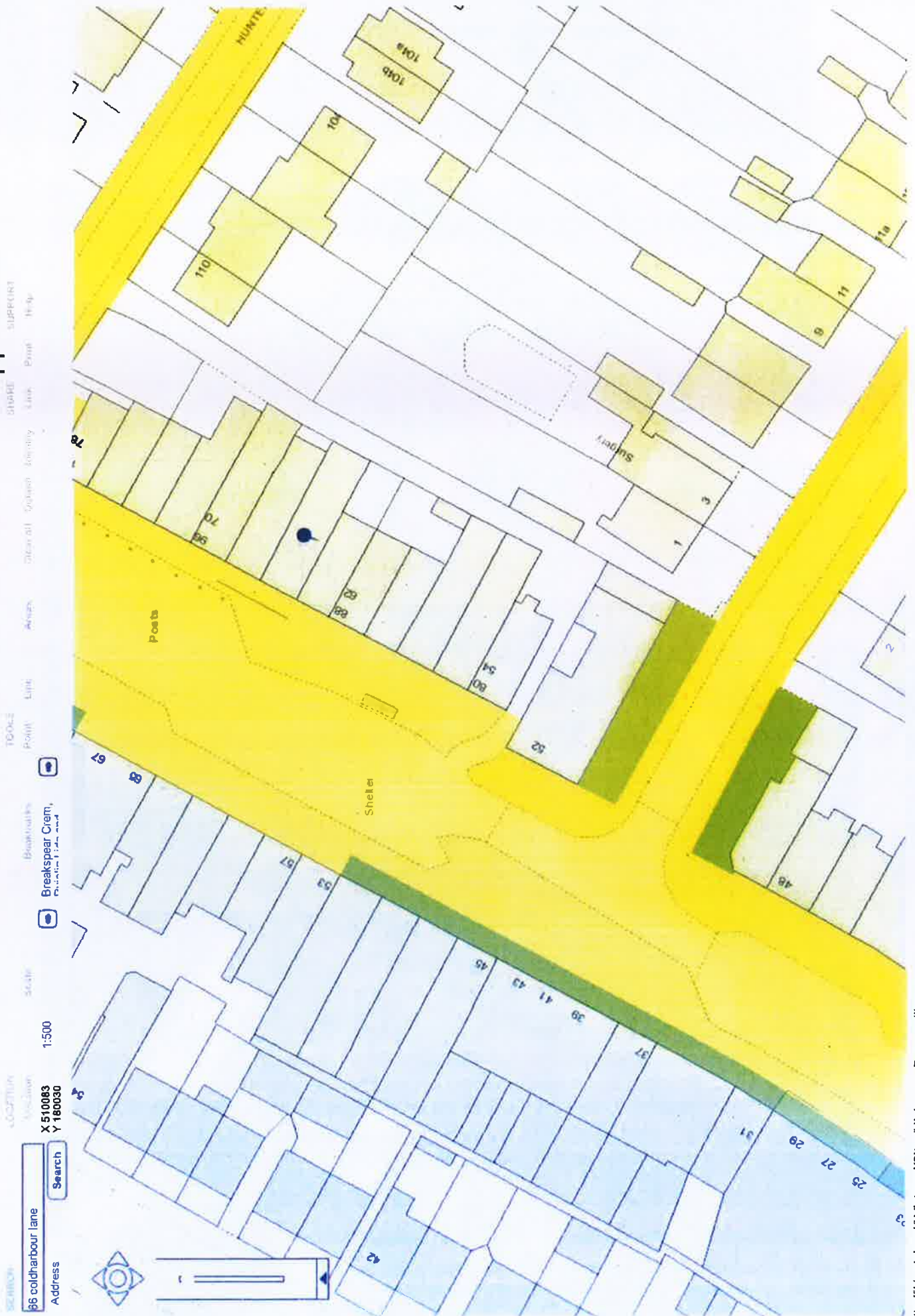
GIS map showing the location of the site.